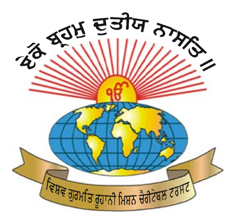
Publisher : Vishav Gurmat Roohani Mission Charitable Trust